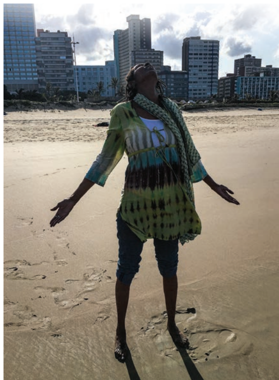
In the background: Durban, South Africa, site of the 25th A.A. World Service Meeting.